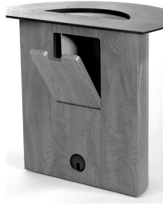
Half Cylinder Base W/Access Door & Grommet