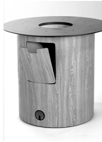
Cylinder Base W/Access Door & Grommet