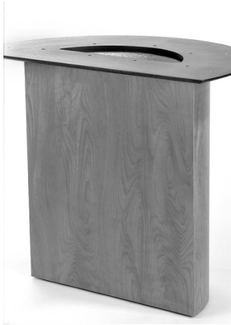
Half Cylinder Base