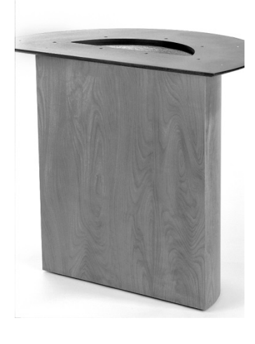
Half Cylinder Base