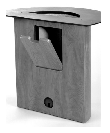
Half Cylinder Base W/Access Door & Grommet